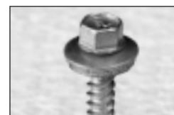
Hex Washer Head with Bonded Washer